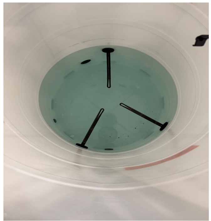
View of Heating Elements from the top of the CIP Tank:

Water Treatment Plant Operators continue working closely with WesTech technicians to optimize operations at the WTP. Work to improve the heating process has been successful with no negative impacts on the heating elements. All three heating elements can be visibly inspected from the access port at the top of the CIP tank as seen in the photo below.